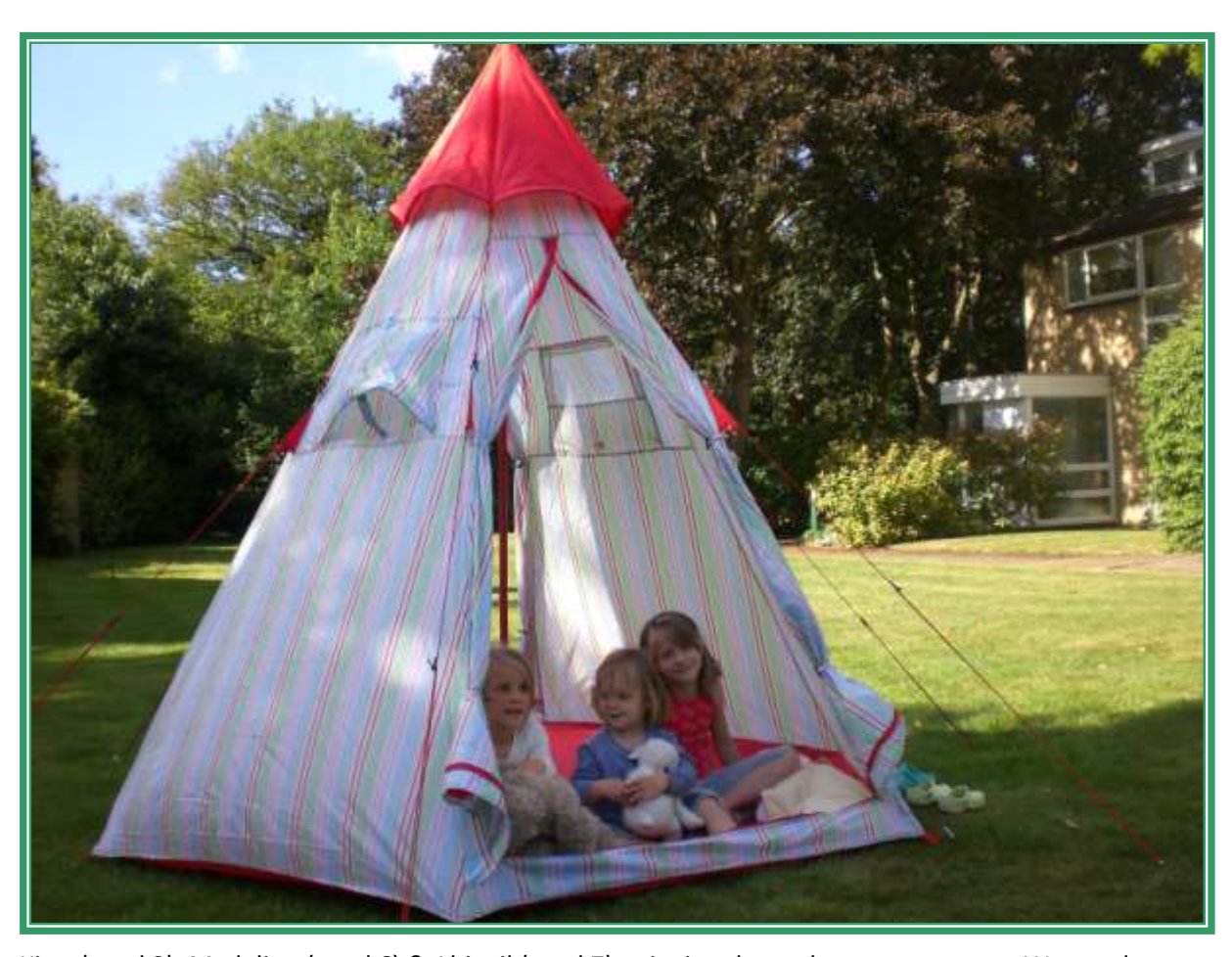
Kitty (aged 2), Madeline (aged 6) & Abigail (aged 7) enjoying the early summer sun on Weymede